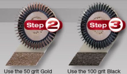
Use the 50 grit Gold