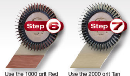
Use the 1000 grit Red