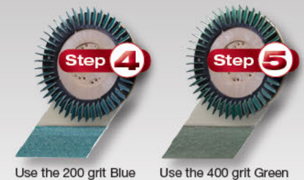
Use the 200 grit Blue